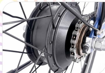
Moteur Sutto Bafang, 250 W, 35 Nm