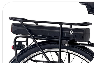
Batterie Greenway 36 V, 7.8 Ah, 281 Wh, BMS intelligent