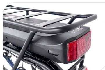
Integrated rear rack