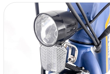
Connected front and rear lights