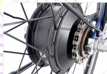
250 W, 35 Nm Sutto Bafang motor