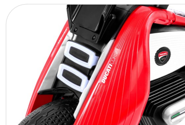
Luce anteriore e posteriore a LED