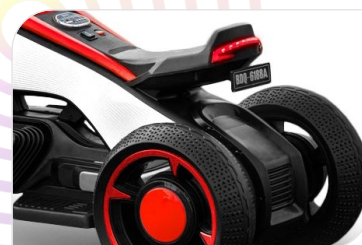
Forward and reverse