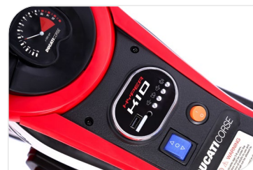
Control panel with sound effects and a USB stick