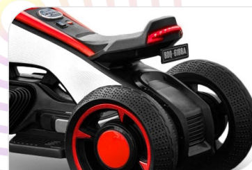
Marche avant et arrière