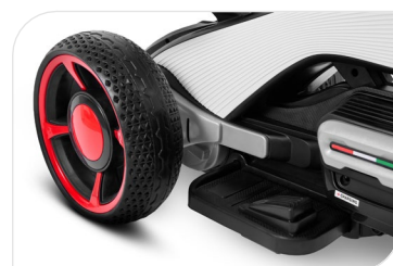
Comando acceleratore a pedale