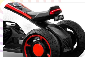
Marcia avanti e retromarcia